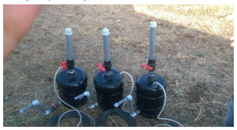
Fig. 2.1 Actual Model and Set up of Anaerobic Digester at farm

Three digesters of 20 liters capacity has prepared for every proportion of co-substrate. Digester has been prepared with proper arrangement of Inlet, outlet and gas pipe and set up at farm in proper manner and shown in [fig 2.1] .Details of digesters operations are given in [Table 2.1] .