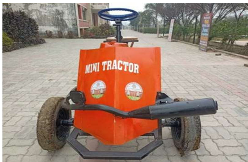
Fig. 1 – Mini Tractor