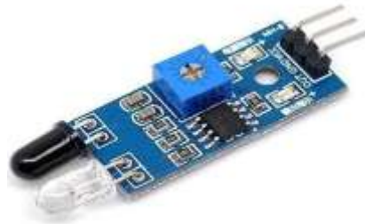
Fig-1: IR Proximity Sensor

We have used IR Proximity Sensor for this device. The function of an IR sensor is to detect the motion on the door knob/handle. It has a range of 10-15 cm with input supply voltage of 5V DC. It is operated at 6.5V and has output voltage for logic one(+3.5V) & logic Zero (0.0V).