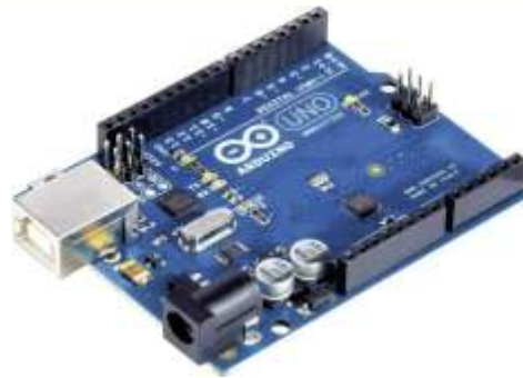
Fig-2: Arduino UNO