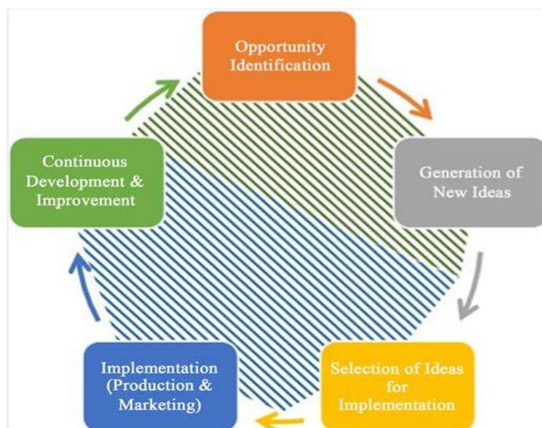
Fig2: An integrative framework for creativity and innovation

This article presents a framework which is known as “An integrative framework for creativity and innovation.” It emphasizes that creativity and innovation both are important for the firm. Fruitful innovative companies exercise the activities in the following domains: Innovation, networks, internalization, organizational learning, and growth. A far-reaching structure proposes that imagination is upheld by authority while the board bolsters development and can accomplish great prompt outcomes, just the mix of the two empowers a progressing fruitful usage. The following framework presents the integrative framework for creativity and innovation.