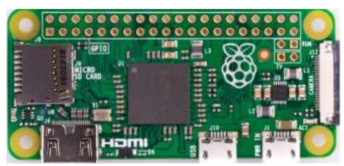
Fig.2 Raspberry-pi zero

The Pi Zero - the smallest, thinnest, most-affordable Pi ever. So much so, it comes free with every issue of MagPi #40. The Pi Zero is small and thin65mm long x 30mm wide x 5mm thick. To keep the Pi Zero low cost, the processor and RAM are kept pretty basic. Instead of the Pi 2's zippy quad core ARM v7, we're back to a single-core 1GHz ARM (same processor in the Pi Model B+ and A+). We also have 512 MB of RAM with a 'package-on-package' setup. Not much has changed here, we're still going with Micro SD for size and ease of use.