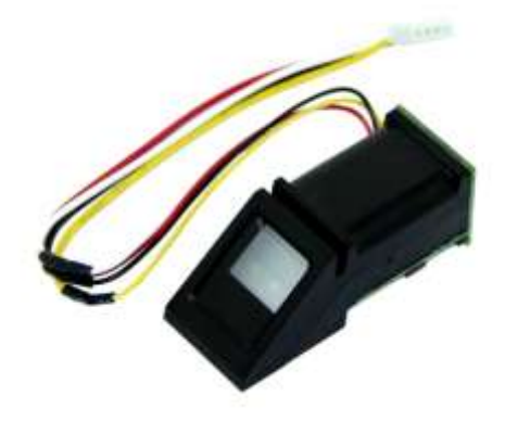
Fig.3 Finger print sensor