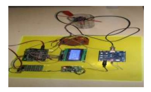
Figure 1. Milk quality analysis prototype model

Low grade milk indicates that adulterants are present in the milk sample and to detect the adulterants present in the milk sample the adulteration test will be performed next. Presence of adulterants in milk releases toxic gases which can be detected using different sensors. Adulterant like urea, hydrogen peroxide, formalin, chlorine etc. are some of the adulterants that are added in milk. [4] Urea is added in the milk to increase its quality that releases gases like ammonia and carbon dioxide. Hydrogen peroxide is added as a preservative. Formalin is added in the milk to enhance its life. Chlorine is added in the milk to increase the density of the milk. Detergents increases the fat value and masks adulterants. Sugar and salt are mixed to increase the lactometer reading to mask dilution with water. These adulterants are detected using different gas sensors like mq136, mq137, mq138, mq3, mg811 etc. The result of the gas sensors will be shown on the LCD screen one by one as we press the respective buttons on the keypad.