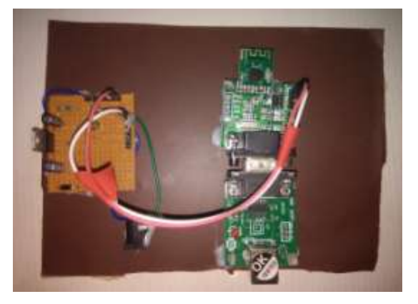
Fig.3 Receiver Model

In figure 2 and figure 3 the project presentation model is provided. The project displays the following results, detection of a metal, displays the humidity, senses temperature and gas. The results are displayed on the LCD and message is being sent through GSM to mobile phones in emergency cases. The communication between two nodes is effectively finished with CAN modules.