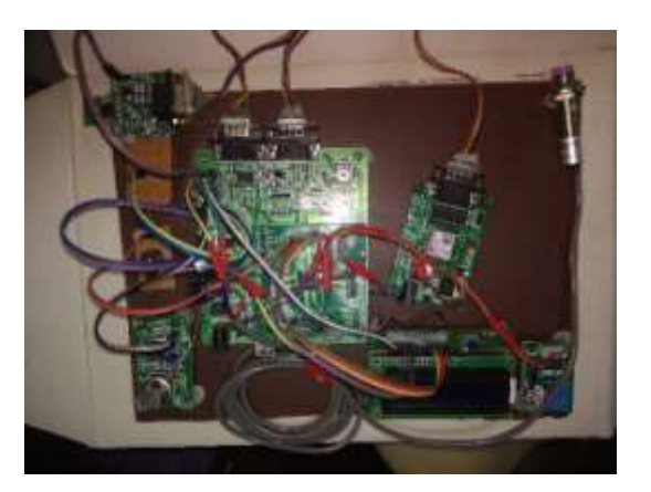
Fig.2 Transmitter Model