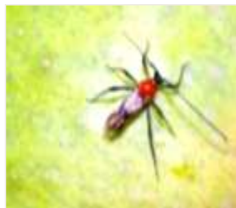
Fig.1: Tea mosquito bug