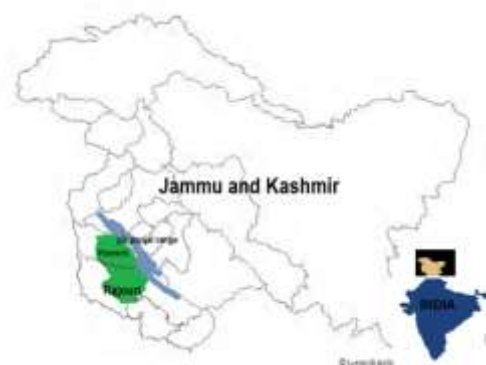
Figure 1 Study area