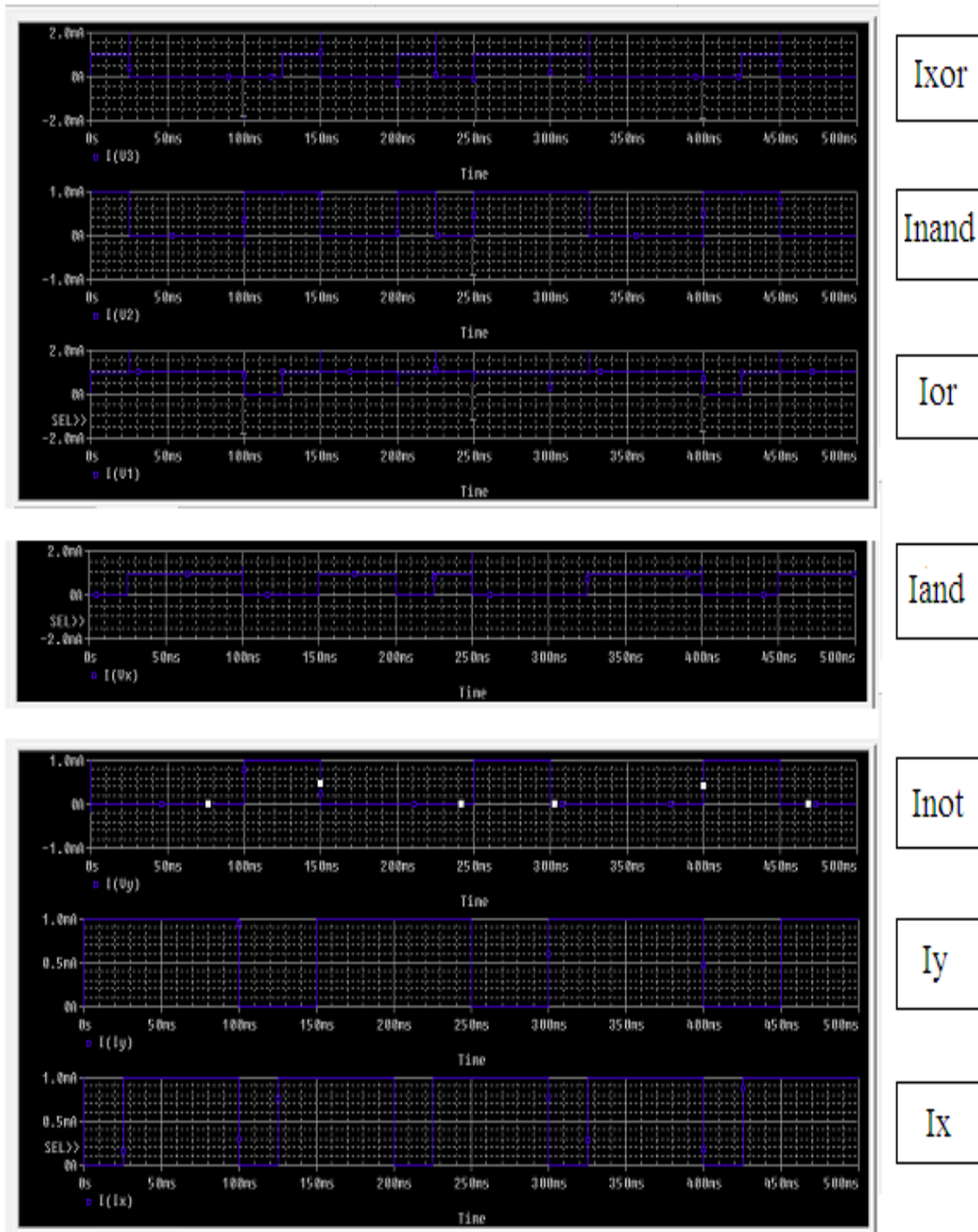
Figure 2. Results obtained from the proposed circuit of Fig. 1 with DC supply voltage= \pm 2V .

and XOR operations are shown in Figure 2. In Figure 2 the currents are sensed using 1 kΩ load resistances. The results obtained are in excellent agreement with the theory presented in equations (1)-(20).