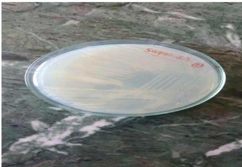
Figure 1-Strained Bacillus Subtilis

Calcite producing bacteria “Bacillus Subtilis” was procured from microbiology department of new arts college Ahmednagar. It is also known as the hay bacillus or grass bacillus. Moreover it is a Gram-positive, catalase-positive bacterium which is found in soil and the gastrointestinal tract of ruminants and humans. A member of the genus Bacillus, Bacillus subtilis is a rod-shaped bacteria also it can form a tough, protective endospore which allows it to tolerate extreme environmental conditions.