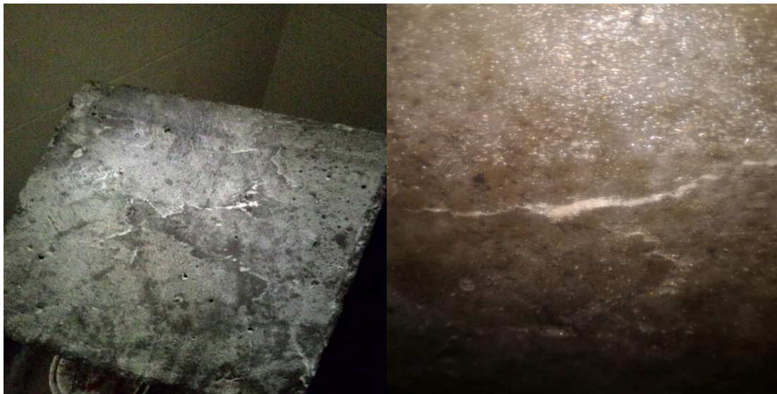
Figure 4- Self-Healed Specimen

After cracking the specimens placed in three exposure conditions which were a) urea ( \text{CH}_4 \text{N}_2 \text{O} ) (20gm/L) + calcium chloride ( \text{CaCl}_2 ) (49gm/L) solution b) water and c) air. At the optimum concentration of bacterial specimen placed in urea and calcium chloride solution gave maximum crack filling as compared to other specimens. The specimens kept in air have negligible crack filled. This shows that for self-healing water is must without which crack cannot be filled. Figure 4 shows the crack filled specimen of urea solution for optimum concentration.