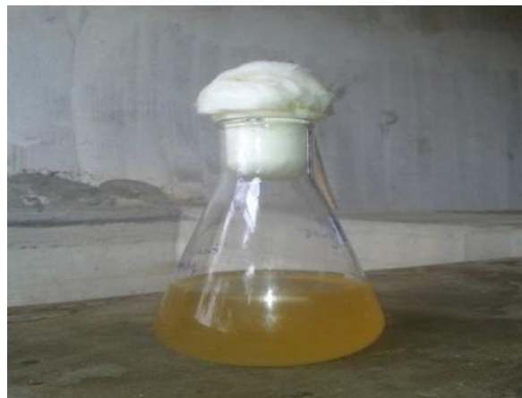
Figure 2-Cultured Bacillus Subtilis

The prepared culture was maintained in a medium of pH around 7. After this the medium was placed into the orbital shaker having speed 125rpm for 4 days at a temperature 37 degree celcius. The concentration of bacteria was maintained constant throughout as 10^5 cells/ml based on earlier research it was found that this concentration gives optimum results. This concentration was achieved by serial dilution method.