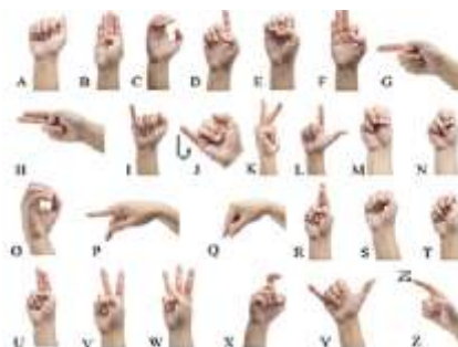
Fig 2: sign language

Figure 2 shows the American sign language. Using the Sign Language the deaf & dumb people will be able to talk like normal people. Depend upon these sign languages we can able to convert the signs into letters or words [11]