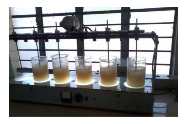
Fig.2 Schematic view of conventional jar test apparatus

Jar test is most widely used experimental methods for coagulation-flocculation. A conventional jar test apparatus will be used in experiments to coagulate sample of water using MO. It will be carried out as a batch test; the jar test apparatus involves the use of stirring device. The stirrer consists of six paddles those which are capable of rotation with the different speed. In this method six beakers of 1 liter capacity are placed, which were dosed with different amount of coagulant and run the apparatus for 45 minutes at a speed of 110 rpm then the stirred sample allowed settle floc for 1-2 hours depending on the floc size formed then the supernatant was taken to analyzed. Before operating jar test, sample is mixed homogenously, then analyze for the initial concentration of the parameters such as pH, turbidity, suspended solids, dissolved solids, total solids, hardness. Then samples are tested for desirable parameters after the jar test, then the results are plotted on graphs.