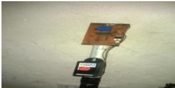
Figure 3:RF receiver pole