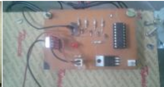
RF transmitter placed in model