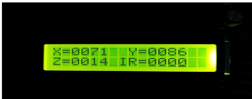
Figure 2: Steady state ADC values of accelerometer

A linear array of IR sensor has been made by mounting all the component on PCB. The reference value of the accelerometer has been calculated by maintaining the accelerometer at the ground level and steady position which is as shown in figure below