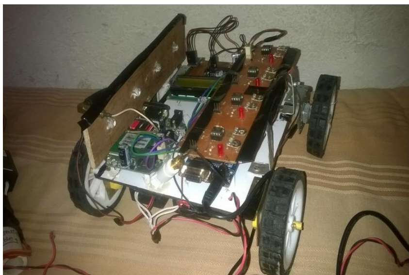
Figure 1: Operating model

A model has been prepared for the demonstration of our complete project. The model image is shown in the fig. The model can be considered as a prototype on which accelerometer is mounted at a reference position and IR sensors are placed linearly. When the model is tilted the reference value is changed and at a particular orientation the threshold value is exceeded, this would therefore detect the accident. On the other hand IR sensors are placed linearly with IR transmitters on one side and receiver on the opposite side. When any object comes in between the transmitter and receiver the transmitted wave will not be able to reach the receiver. This, therefore can be considered as the wreckage of the vehicle and hence accident can be detected. The GSM and GPS modules are also mounted on the model itself.