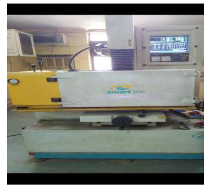
Fig.1. Electro Discharge Machine

About experimental set up. The experiment performed on ZNC electrical discharge machining. The basis parts of EDM consists of a wire electrod, a work table, and a servo control system, a power supply and dielectric supply system. The practical experiment conducted at MMMUT (Madan Mohan Malaviya University of Technology, Gorakhpur).