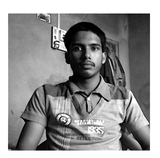
Fig . Grayscale Image