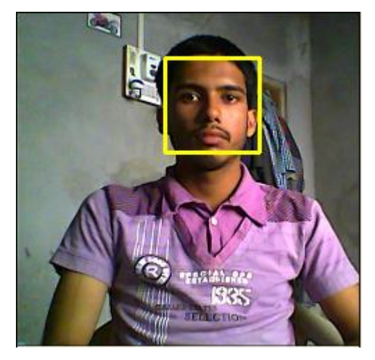
Fig. Face Detection