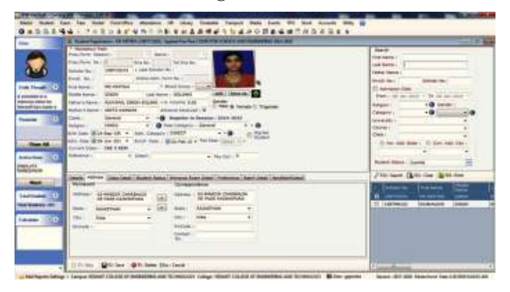
Fig.7 Student Module