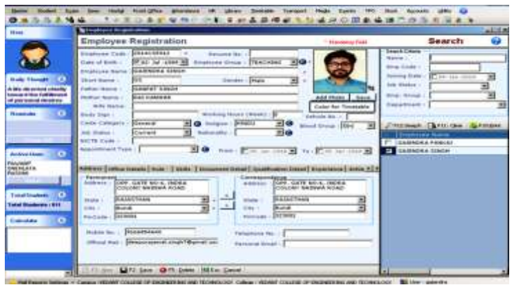
Fig. 6 Employee Module