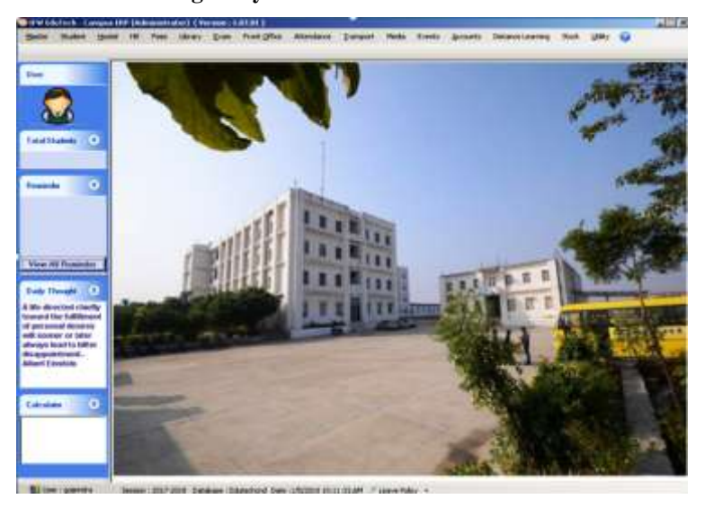
Fig. 5 Home Page