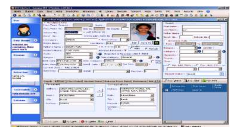
Fig. 7 Student Module

Admin can login to the System where they can add and update the student details in the database. The database contains student profiles, attendance, internal marks exam schedule and University grades. Parents can login to the system to view the details which are entered by server. Parents only view the details and not have update permissions.