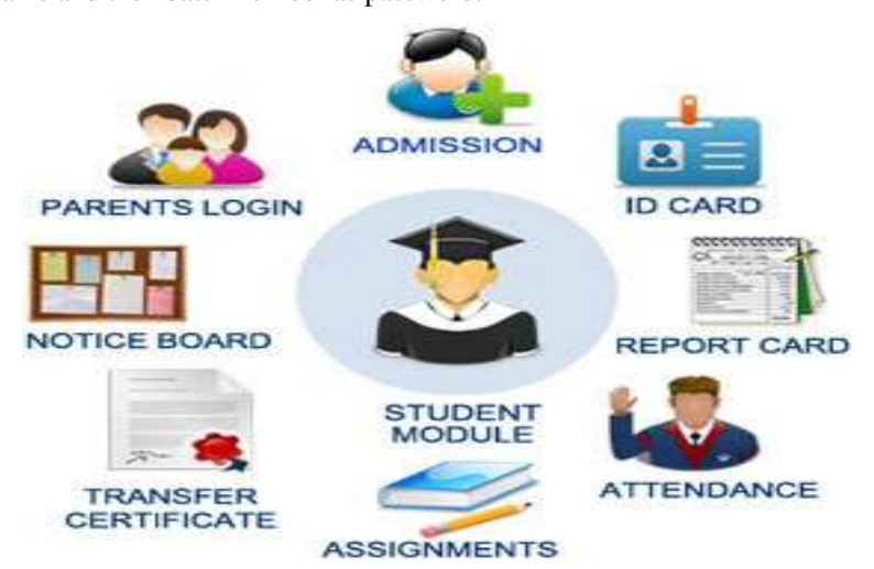
Fig 3. ERP Module

The proposed system for college information system is fully an automated one using Wireless Android. In this system, we are using PHP Page for Admin side to maintain the student details. Admin can register the student details and requirements such as attendance, exam details are added into the database. Parents can login to the system as student name and then batch number as password.