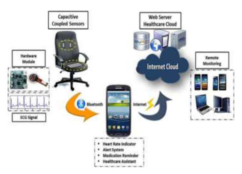
Fig. 4 System Architecture of ERP.