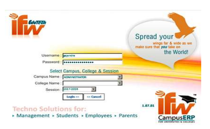
Fig 2- Registration Page

Volume No.07, Special Issue No. (02), January 2018 www.ijarse.com