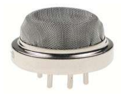
FIG 2. Hanwei sensor model MQ-06