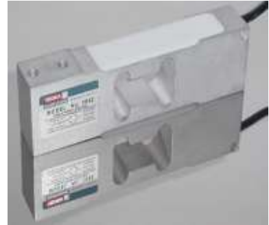
FIG 5. Tedea-Huntleigh make load cell

Features Capacities: 1 - 100 kg (2.20 - 220.46 lbs) , Anodized aluminium construction , 6 wire (sense) circuit Single point 16 inch x 16 inch platform IP66 PROTECTION