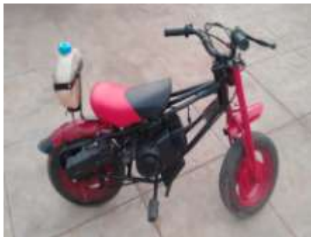
Side view of the mini bike

Maximum stress:295310N/m 2 Maximum stress:0.0207289mm