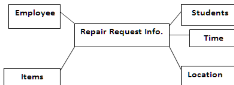
Fig: Developed Star Schema for the proposed Data warehouse