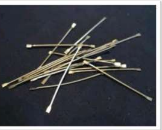
Figure 1.3: Flat End Steel Fiber