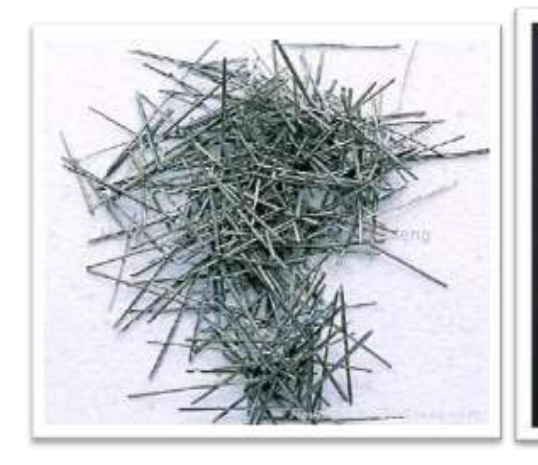
Figure 1.2: Melt-extracted fibres