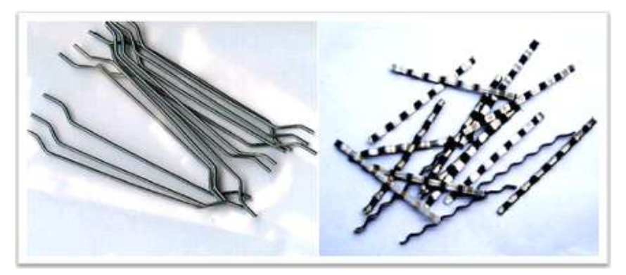
Figure 1.4: Hook tain Steel Fibre