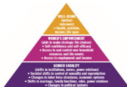
figure 2 : FROM WELL-BEING TO EMPOWERMENT TO GENDER EQUALITY

Women's empowerment is defined as "women's ability to make strategic life choices where that ability had been previously denied them" (Kabeer 1999). As we articulate it, empowerment is midway in the change processes that benefit women at individual, household, community and broader levels. At the most basic level, innovations can benefit women simply by improving their well-being in terms of health, nutrition, income, lifespan, etc. (Figure 2). Beyond vital improvements in well-being, changes can result in women's empowerment, where women gain agency and resources to make decisions, build confidence and act in their own interests. Deeper and truly transformative changes reshape societal norms, attitudes and institutional practices. Greater gender equality in markets, political institutions, family systems and social roles provide an ongoing foundation for sustaining women's well-being and empowerment.