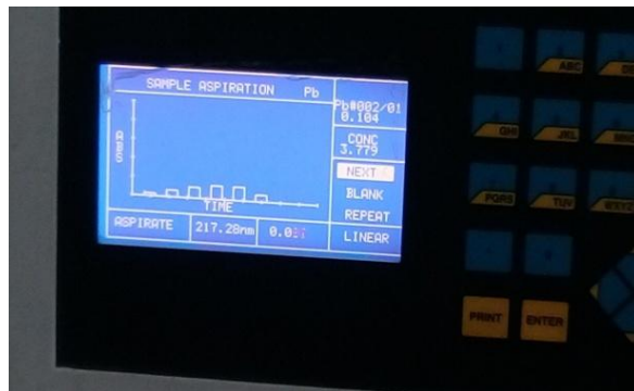
Fig.8. 2. The adsorption % display on ASM