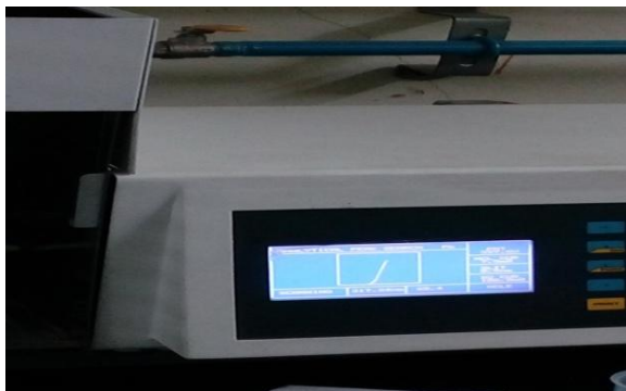
Fig. 8.1 The time response