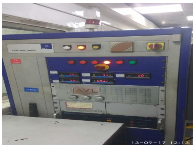
Fig. 1: display for engine testing unit.

Every Industry has separate engine testing department. There is a complete testing setup for every engine that comes out of the assembly line. Here engine is thoroughly checked for its working and any possible faults such as