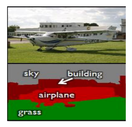
Fig 4: Sample results of simultaneous Object Class Recognition and Segmentation algorithm. Adapted from [5]

of categories. Unlike object recognition methods that intend to find a particular object, multi-class image segmentation methods are intended at concurrent multi-class object recognition and attempt to classify all pixels in an image. For each super pixel region, this method first extracts appearance (color and texture), geometry and location features. Then boosted classifiers are learnt over these features for each region class. Finally, a CRF or logistic model is learned using the output of the boosted classifiers as features. It does not distinguish between objects at different scales. Fig 4 shows the example results of simultaneous object class recognition and segmentation algorithm.