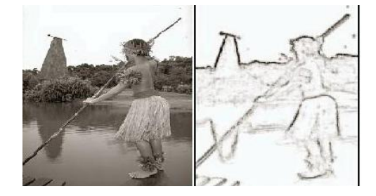
Fig 5: Example result of Supervised Learning of Edges and Object Boundaries. a) Gray scale image from Berkeley Dataset. (b) BEL result. Adapted from [1]

length of boundaries; 3D surface orientation estimates and depth estimates. Develop the segmentation gradually by iteratively computing cues over the current segmentation and using them with the learned models to combine regions that are likely to be part of the same object. Each iteration consists of three steps based on the image and the current segmentation: (1) compute cues; (2) assign confidences to boundaries and regions; and (3) remove weak boundaries, forming larger regions for the next segmentation. Fig 5 shows the example result of supervised learning of edges and object boundaries.