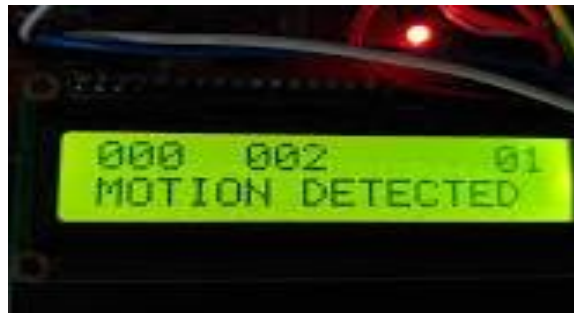
Figure 3B. LCD display showing the intruder detection.