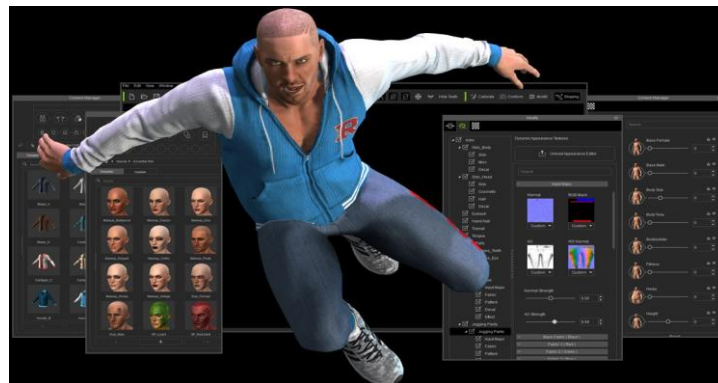
Figure 2: Character design software

It is important to design a strong and convincing character that is suitable for the given context and looks visually appealing. Expressions and posture should also match with the theme of the game especially role playing games.