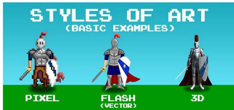
Figure 1: Example of Vector Image.

User Interface Design (UI) and User Experience Design (UX) is the first and foremost thing that the end user will interact with while playing the game, so it is extremely important to keep it user focused. Different people involved in UI/UX design are Game design artist, sound and music artist, front end developers, script writers and animation artists. They all need to coordinate and deliver a good design which must be fast enough to render on various devices with differing screen resolution and graphics capabilities and must also synchronize with the back end code implementation for smooth performance. It is advised to use vectors (Figure 1) to make sprites, so that they can be magnified to a great extent without having any blurring.