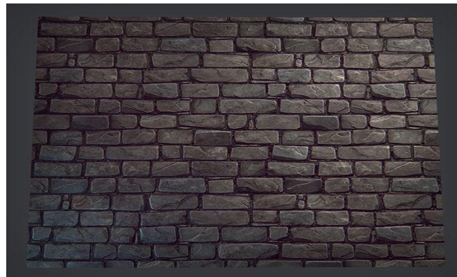
Figure 3: Wall texture design

Apart from animation, music and tones play a great role in enhancing the overall game play. Sound is used to exaggerate the effects shown in the motion. Examples include punch sound, bullet firing sound, background music etc. In some games like first person shooter games footsteps of the enemy helps in making good decisions. Examples of sound making software are FMOD, Audio kinetic and Fabric etc.