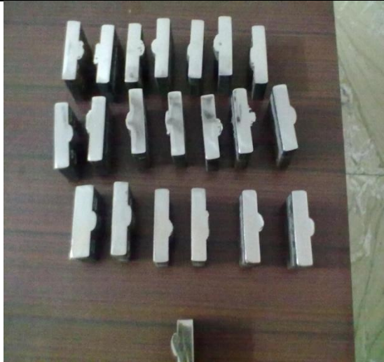
Figure: 1(a) Photographs of bead on plate welds.