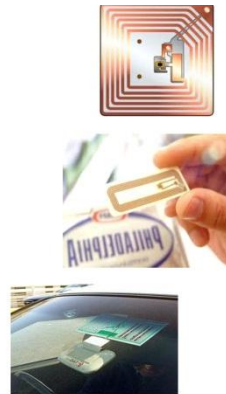
Fig.2 RFID TAGS