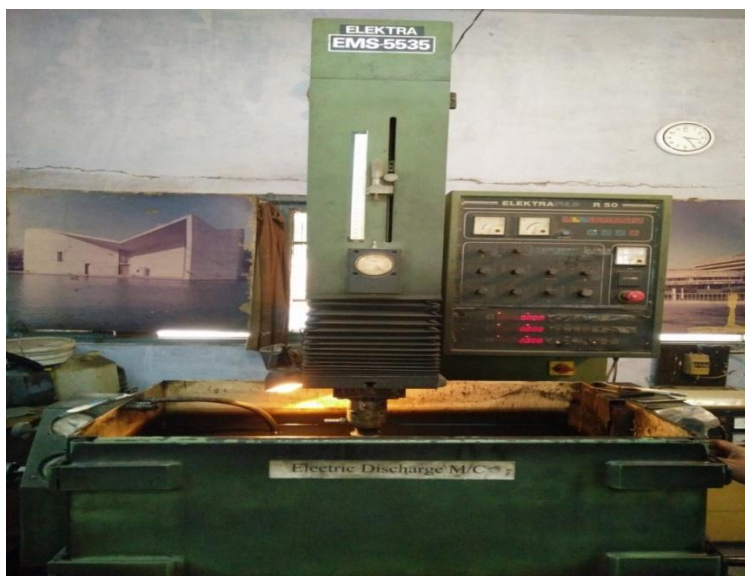
Figure 2.1 Electric Discharge Machine