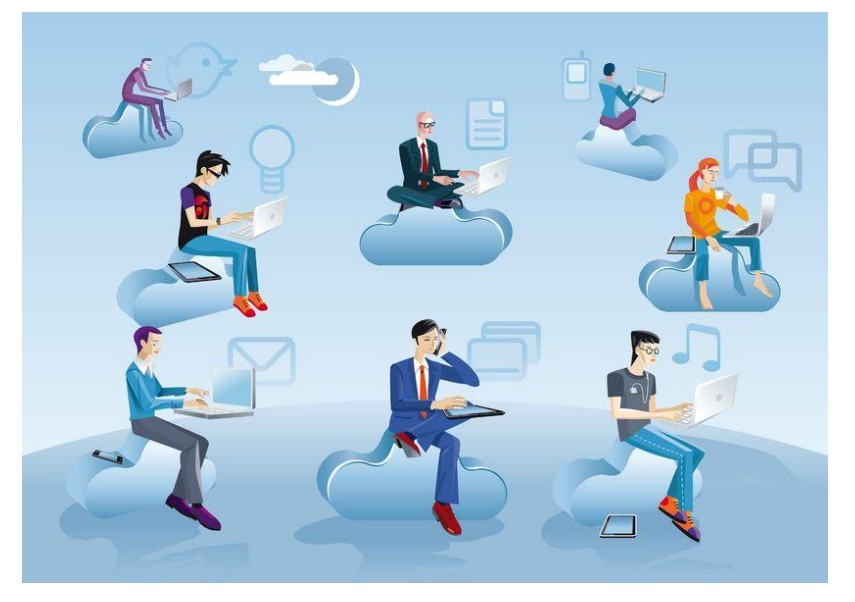
Figure 2. Cloud Agent

different geographical positions. Therefore an algorithmic efficiency must be taken into account with other parameters.