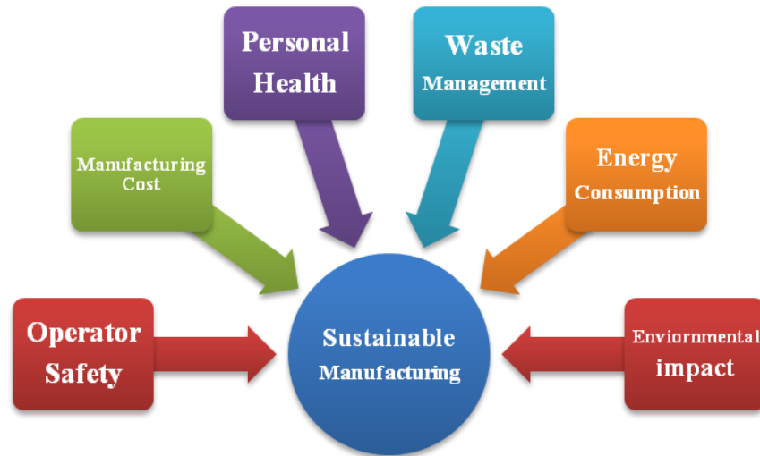
Fig 1.1 Sustainable Manufacturing

fluids are normally used in dry machining enjoys some benefits over conventional cooling like they are nontoxic, environmental friendly, safe, clean, etc. They absorb heat quickly and dissipate it to environment without releasing harmful residues