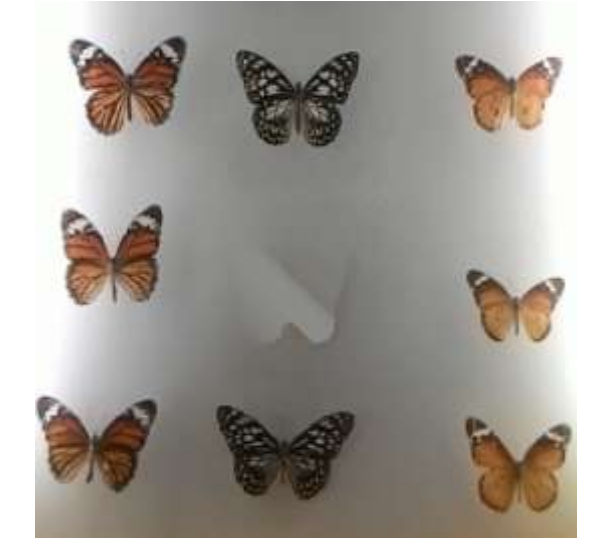
Figure2 Inpainted Image with Object Removed