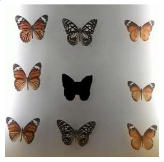
Figure1 Original Image with Object Marked

The discussed algorithms are tested on a variety of images to investigate the performance of Inpainting. The proposed algorithm is implemented in MATLAB 7.7.0.471 R2008b.Evaluation of Inpainting by perceptual quality is subjective in nature. However, this is a difficult task and there is no common method for evaluating Inpainting algorithms. Hence, we have to rely on qualitative evaluation. The contours are well reconstructed and recovered with a good track of the local geometry image and isophotes. Figure 2 and Figure 3 show the input and output image of the algorithm. In figure 2 we can see that the object to be removed is marked by the user and that region is initialized to zero pixel value. Figure 3 we see that the pixels are filled with the neighboring pixels proceeding in the line of equal intensities.