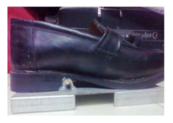
Fig. 4: Side view of left shoe with laser