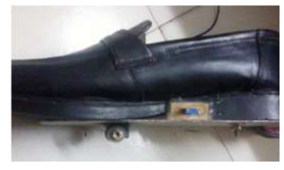
Fig. 6: Side View Of A Mobiokle Shoe (Right Shoe)