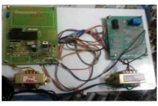
Fig. 5: Kit Snapshot