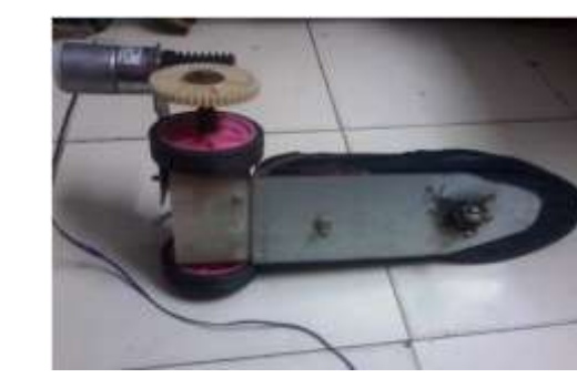
Fig. 7: Motor and Wheels Attached Fig. 8: Bottom View of the Right Shoe to the Mobile Shoe