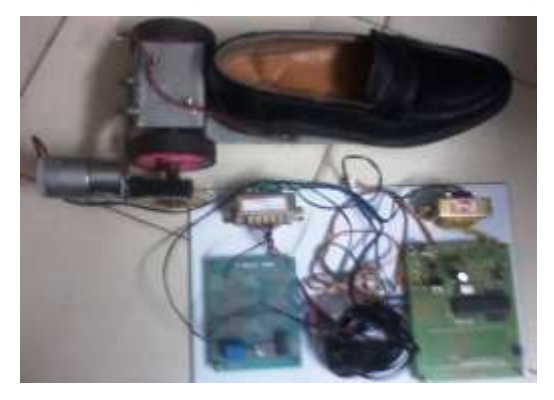
Fig. 9: Mobile Shoe Attached With Hardware

Fig. 7: Motor and Wheels Attached Fig. 8: Bottom View of the Right Shoe to the Mobile Shoe