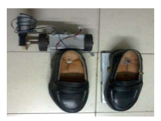
Fig. 3: Top view of mobile shoe

The snap shots of the prototype of our proposed mobile shoe are shown in Fig. 3 to Fig. 8.