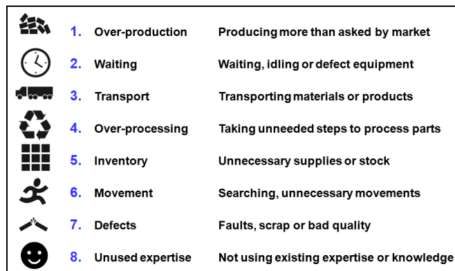
Figure 3: Waste in Industry

One of the major principles of lean manufacturing is elimination of wastes however; in order to effectively remove waste in the production process the activity should first be measured. Small and mid-sized enterprises interested in eliminating waste and improving the quality of their products must set lean manufacturing indicators. For instance, a company may aim at achieving a 50% reduction in lead time in a manufacturing plant in order to increase availability of their products in the market. Without indicators it would be hard for companies to implement lean manufacturing practices as they are implemented on the bases of the set objectives.