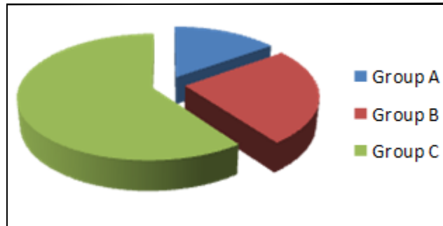
Figure1: Implementation of Lean Manufacturing

The results of the study indicated that employees were grouped into three categories according to the level of awareness of the lean manufacturing process. Group A comprises of responses as non-lean manufacturing program, Group B comprises of respondents indicating that they were in transition to lean, and Group C comprised of respondents with adequate information of the lean practices.