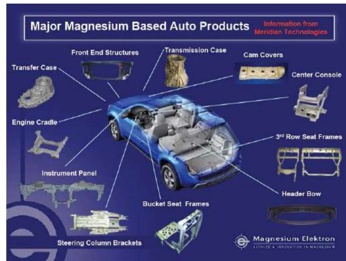
Fig.1: Some of the Major Magnesium Based Automotive Components

(AM60B), steering wheel armatures (AM50 [Mg-5Al-0.3Mn], AM60B) and valve and cam covers (AZ91D). Fig.1 shows some of the automotive components made from magnesium alloys.