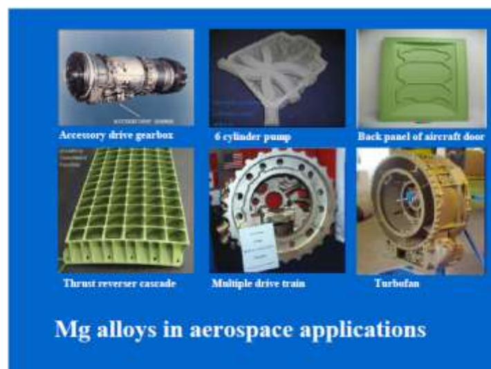
Fig.2: Some of the Aerospace Components Made up of Mg Alloys

Magnesium has seen quite extensive use in both civil and military aircrafts. Some applications include the thrust reverser (for Boeing 737, 747, 757, 767), gearbox (Rolls-Royce), engines, and helicopter transmission casings, etc. Military aircraft, such as the Euro fighter Typhoon, Tornado, and F16, also benefit from the lightweight characteristics of magnesium alloys for transmission casings. There is also widespread use of magnesium in spacecraft and missiles due to the requirement for lightweight materials to reduce the lift-off weight. This is coupled with its high specific mechanical properties, ease of fabrication, and other attractive features such as its capability to withstand (i) elevated temperatures, (ii) exposure to ozone, and (iii) bombardment of high-energy particles and small meteorites. Alloys such as ZE41 (Mg-4.2% Zn-0.7% Zr-1.3% MM), QE22 (Mg-0.7% Zr-2.5% Nd-2.5% Ag) and particularly WE43 (Mg-4% Y-3.25% Nd-0.5% Zr) are commonly used for aircraft applications due to their improved corrosion and creep resistance. Fig.2 gives some of the aerospace components made from magnesium alloys.